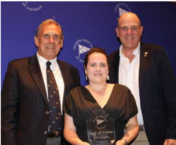
CYCA Hall of Fame