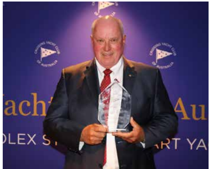
CYCA Hall of Fame