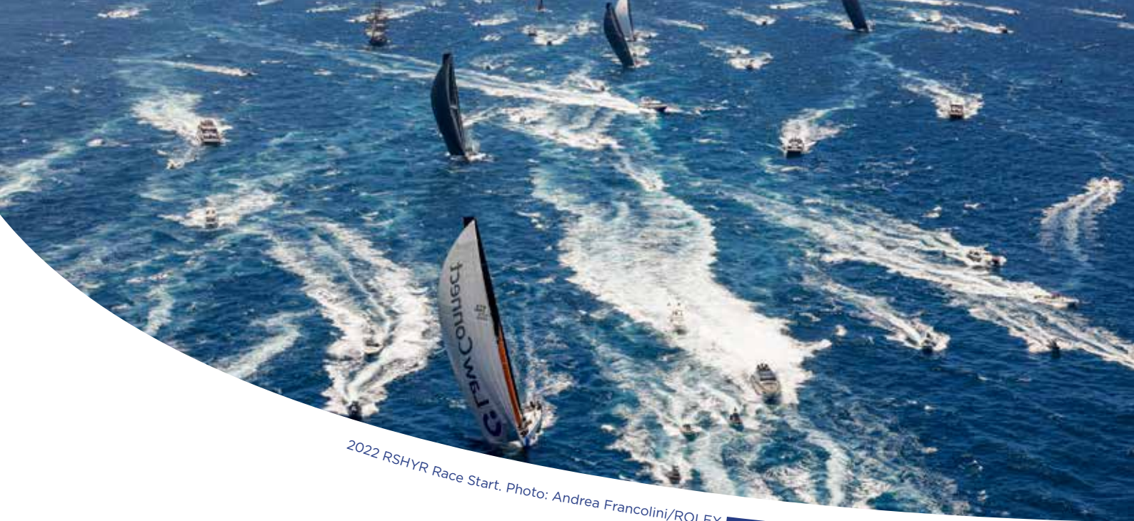
2022 RSHYR Race Start.