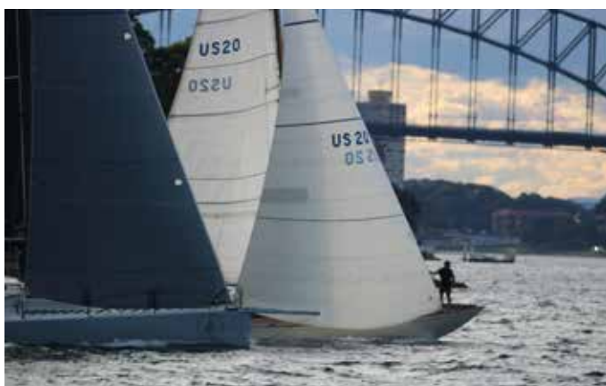
Income Asset Management Wednesday Twilight Series

We also saw strong representation in our Blue Water racing calendar which included 19 current or alumni sailors competing in the 2022 Rolex Sydney Hobart, four of whom completed their first trip south. Alumni sailors also took part in Olympic Class World Cup events, SailGP and became Etchells Australian National Champions.