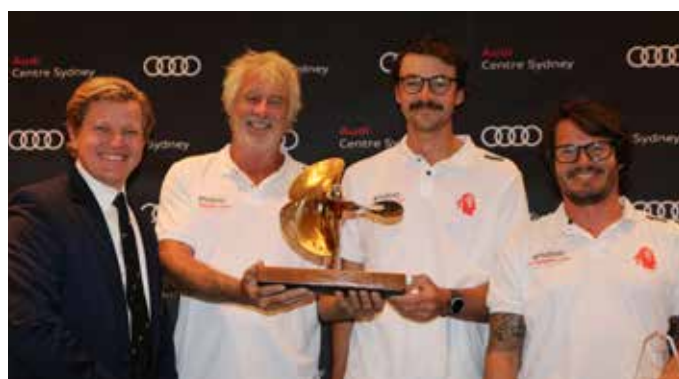
2022-23 Audi Centre Sydney BWPS Prizegiving - Andoo Comanche