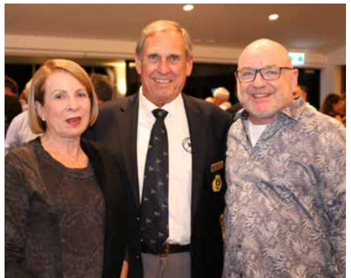
Welcoming New Members