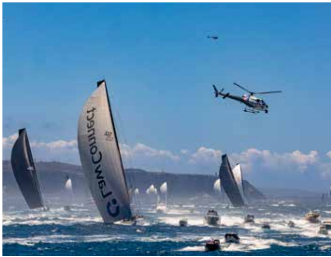
RSHYR Race Start.

Financially, the Club had another strong year and has recovered well from the challenges of the COVID period over the preceding years, exceeding budget expectations. Revenue from race and marina fees, membership fees, merchandise and increased food and beverage sales were all positive. The Club continues to generate positive cash flows.