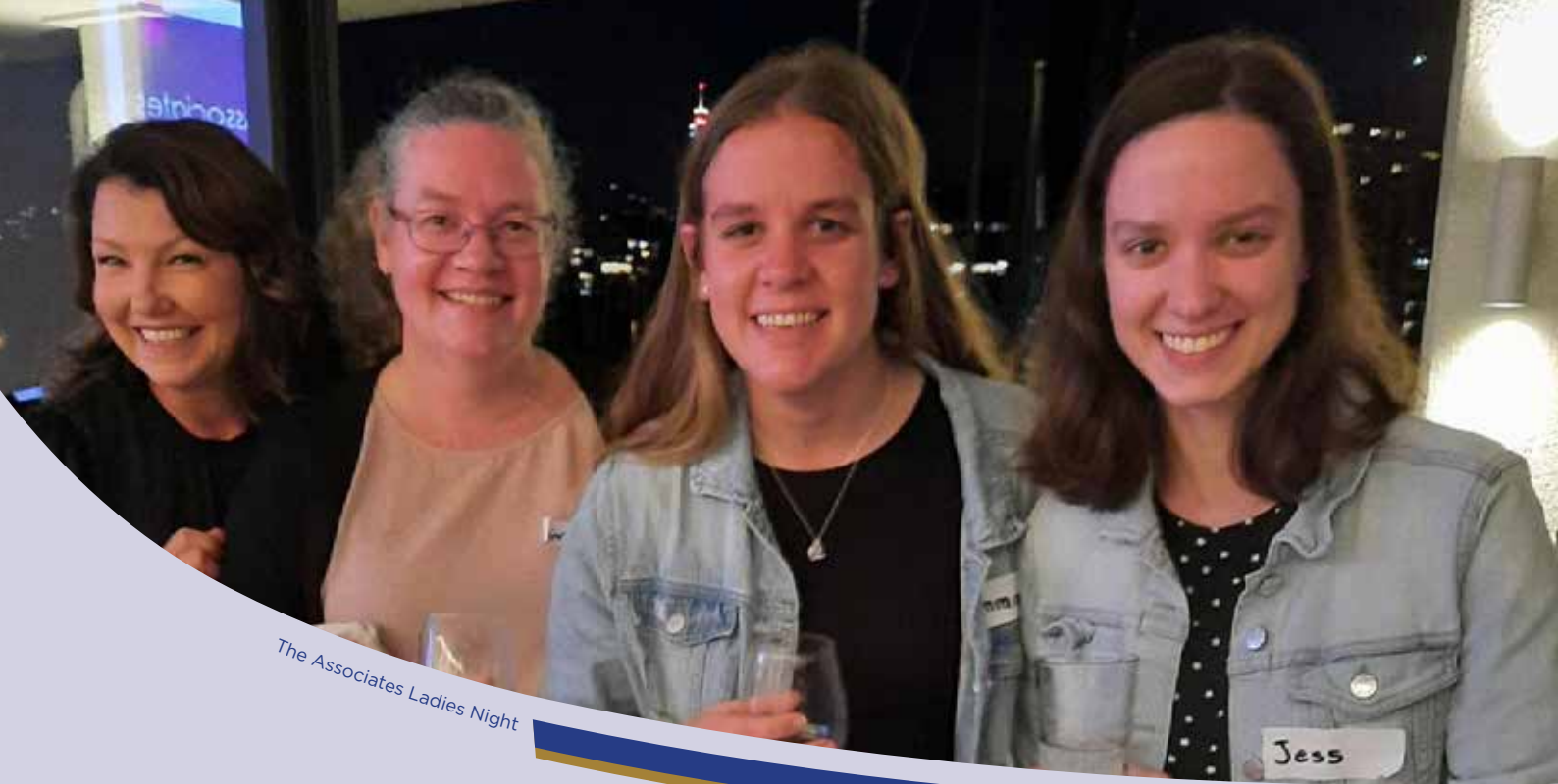
The Associates Ladies Night