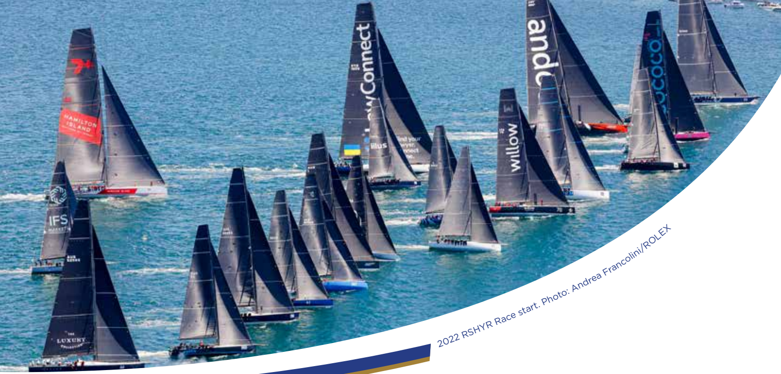
2022 RSHYR Race start.