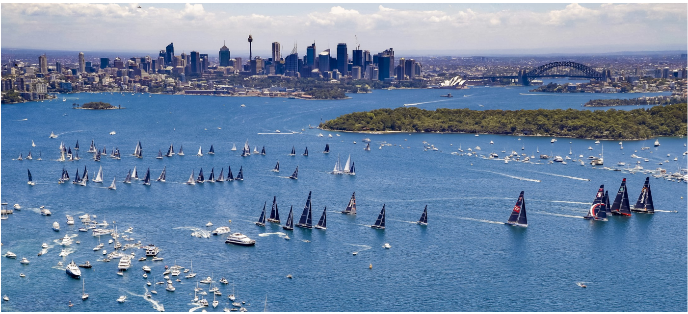
The start of the 75th Rolex Sydney Hobart Yacht Race on 26 December 2019

Sydney is Australia’s largest city and is the capital of New South Wales. Home to approximately 5 million people, visitors can enjoy the cities pristine coastline both inside the largest harbour in the world or along the rugged coastline to the north and south.