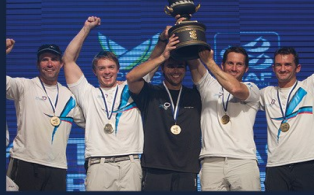
BEN AINSLIE Team Origin