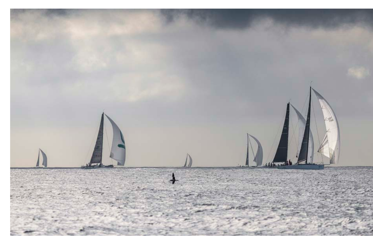
Throughout the fleet yachts were in close quarters with competing teams along the 628-nautical-mile journey, Credit - Rolex/Kurt Arrigo

In the race for the Tattersall Cup, TP52s filled the podium, with Ichi Ban, Gweilo and Quest placing first, second and third respectively. But the result was not without controversy. Quest made the podium after Envy Scooters was