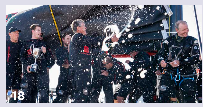
ROLEX SYDNEY HOBART YACHT RACE RESULTS

The historic 2019 Rolex Sydney Hobart - the 75th Sydney Hobart Yacht Race - was one for the history books!