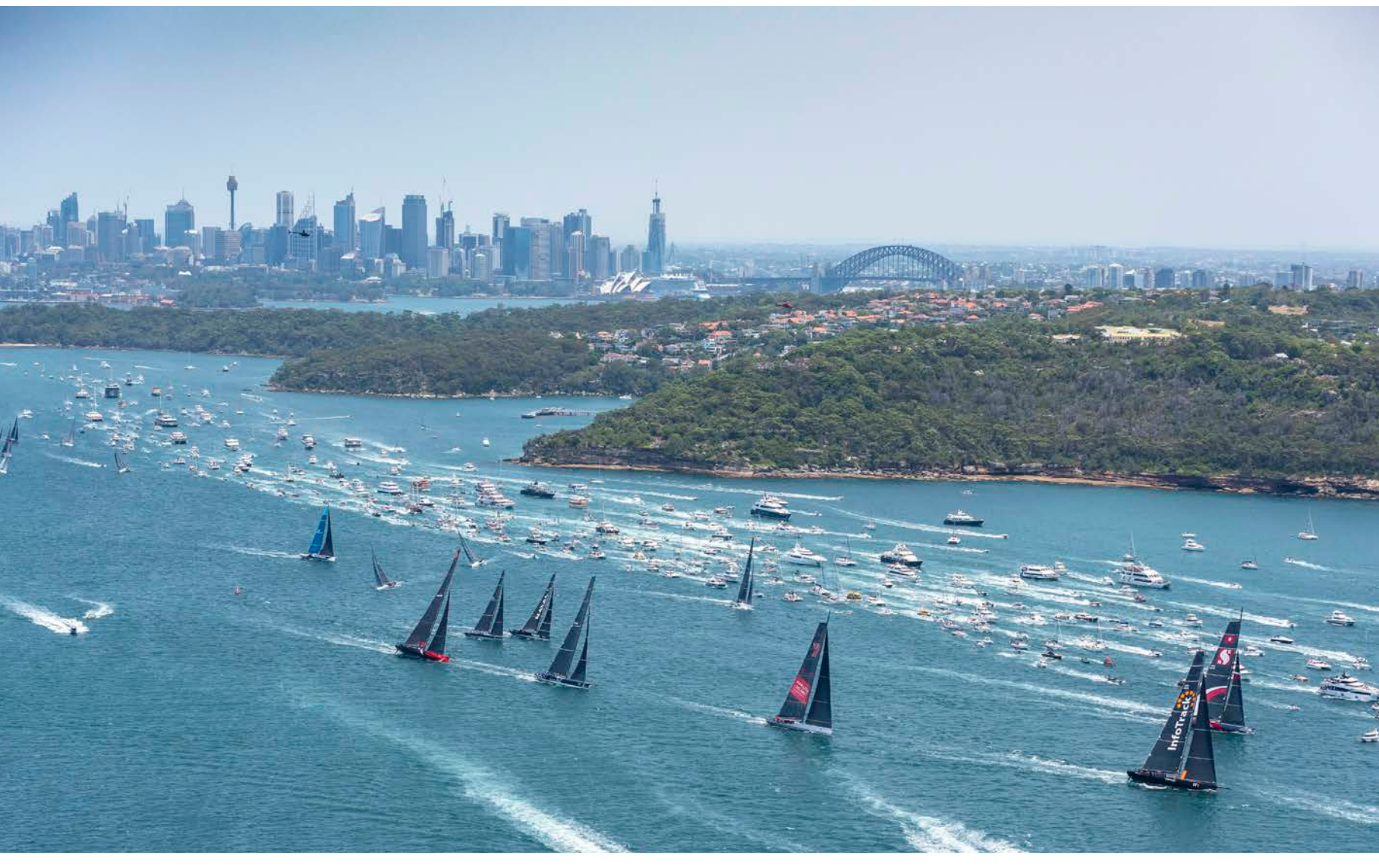
The spectacular 157 strong fleet draw a crowd to watch the action on Sydney Harbour.

The start was fantastic for us. It's always been my dream to be first out of the Heads.