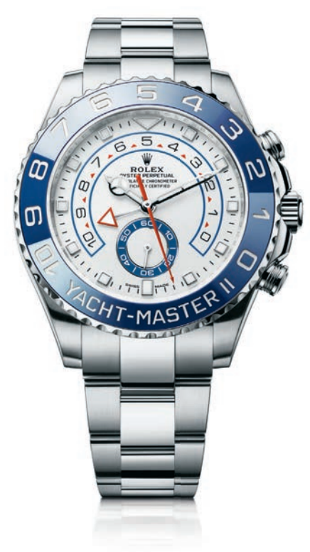
OYSTER PERPETUAL YACHT-MASTER II