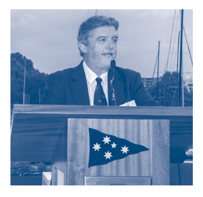
There have been huge strides in developing policies, reforming contracts and documenting procedures

The race has attracted interest from many around the globe where many will agree that #sailinghasnoborders. Much of this essence is featured in the video presentations by Rolex available in the "Spirit of Yachting" programs and also on shorter videos about the Race I heartily commend to you. You can access these on the CYCA TV channel on YouTube.