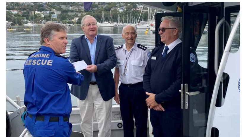
Funding from the CYCA SOLAS Trust enabled Marine Rescue Middle Harbour to purchase new boat engines.