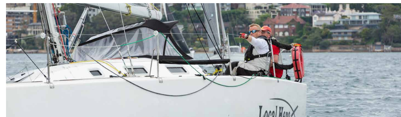
Congratulations to Local Hero on her Summer Season success.