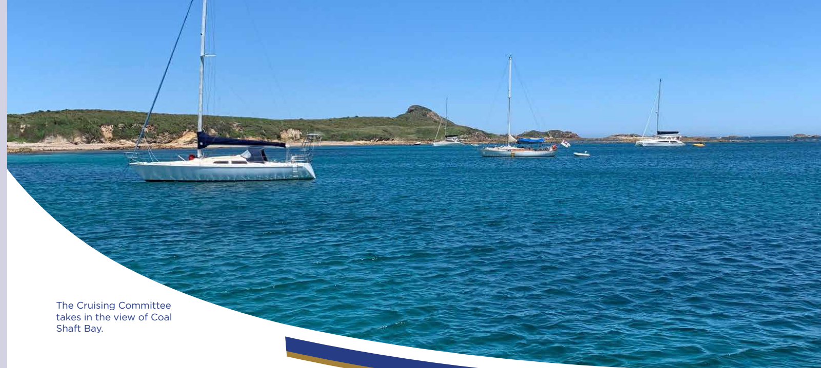
The Cruising Committee takes in the view of Coal Shaft Bay.