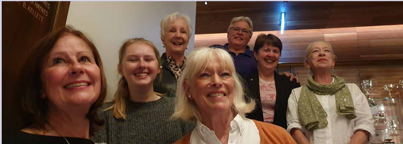
The Ladies' Night continues to be a successful event for the Associates Committee