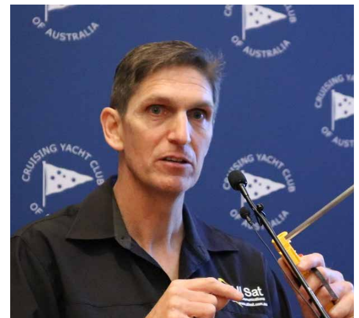
The Cruising Committee hosted an engaging information evening on satellite information systems.