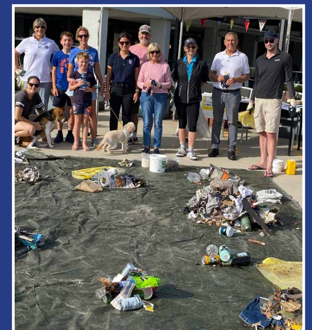
CYCA Staff continued to support Clean Up Australia Day in 2021