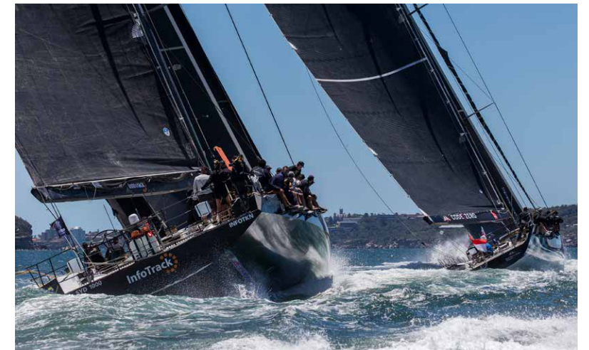
Grinders Coffee SOLAS Big Boat Challenge 2020.

The CYCA Members should be proud of the activities of the SOLAS Trust.