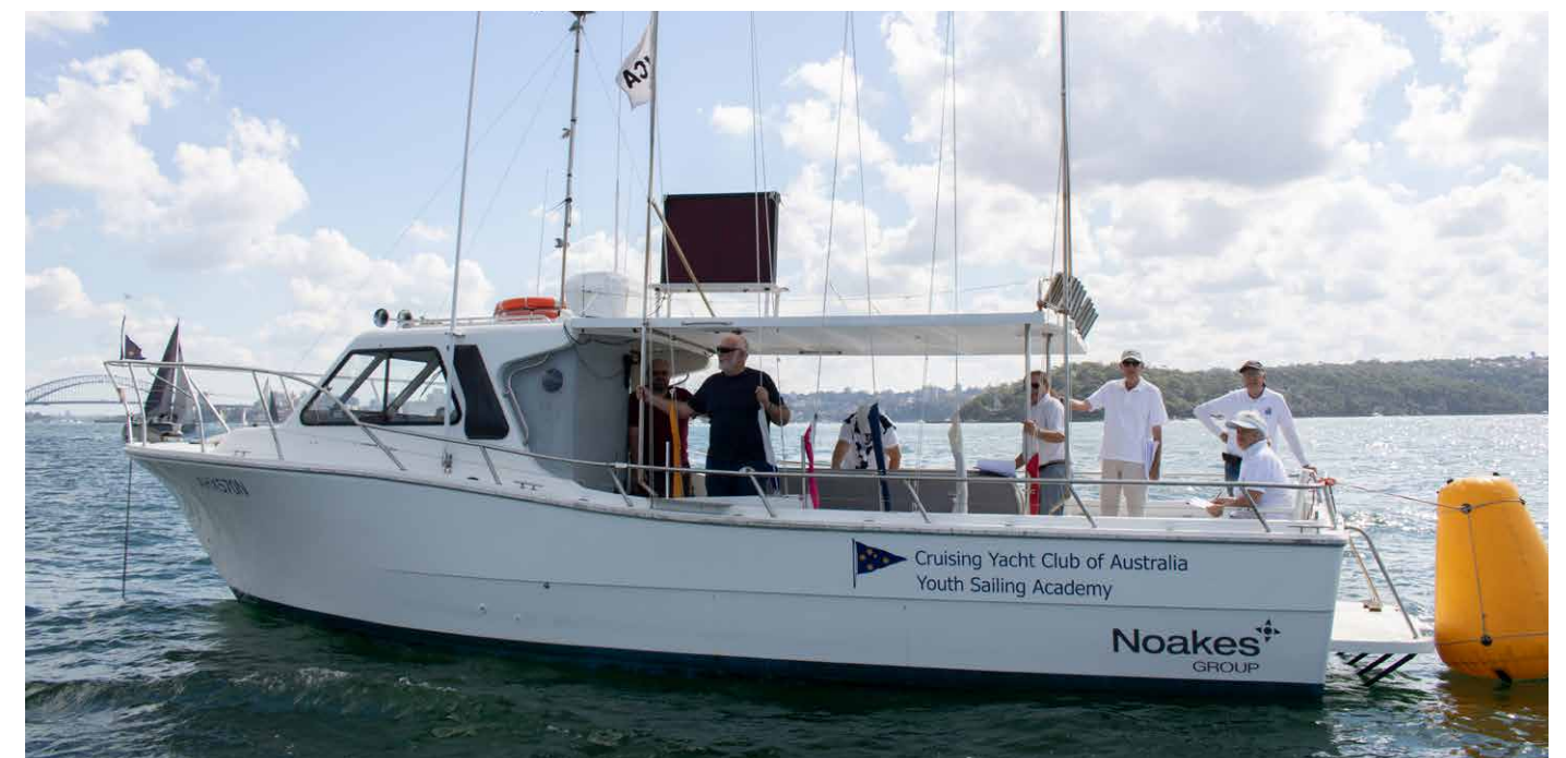
Our passionate volunteers ensured events and races could continue despite the challenges of COVID-19

Of particular note, the six SeaBin units installed in late 2020 have already removed over 3.4 tonnes of rubbish from Rushcutters Bay. These and events such as Clean Up Australia Day at the CYCA have had great support from our Members.